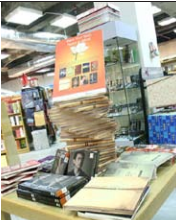
Gorgeous arrangements of KMPs products in Times, BSC.