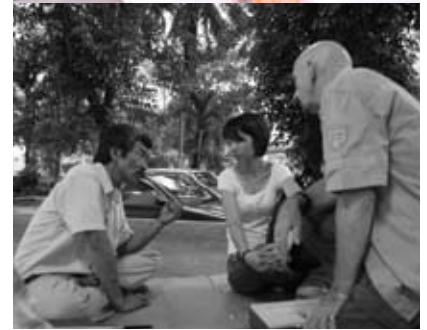
FROM TOP TO BOTTOM Volunteers gather every weekend to hand-pack food for the homeless.