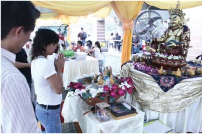
KH members and new friends stop by to make prayers and offerings to Dzambala.