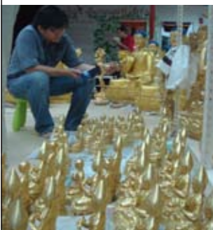
Beautifying an army of Tsongkhas statues.

The full assignment was completed in mid-April, making many more Buddha images available to people for practice, prayer and collection of merits for advancement in their spiritual path.