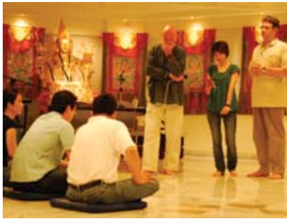
Heruka team (left) and Vajrapani team go head-to-head in their debate of the 2nd verse.