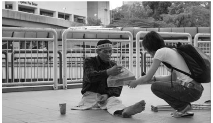
KSK provides food to everyone regardless of race, religion or background.