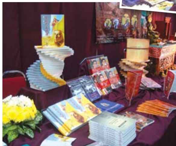
Kechara Media & Publications had their own vibrant, catchy booth at the road show to showcase their books and DVDs, and share Rinpoche's teachings with Malaysians up north.