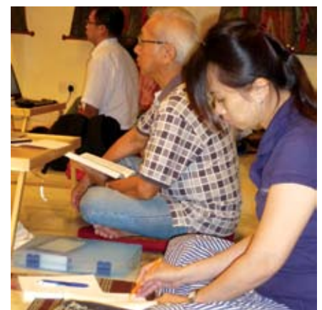
All the lessons are structured and based on Pabongka Rinpoche's excellent teachings in Liberation in the Palm of Your Hand .

When we gain a firm understanding of the Dharma, our faith in the Three Jewels also increases; this leads us to yearning for more knowledge to improve ourselves and be in a better position to help others.