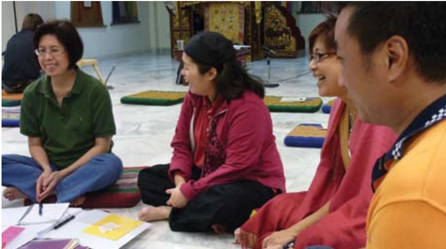
The Lamrim classes encourage lots of discussion between the students.

W e may ask how we should learn the Buddhadharmas systematically, in a way that is more structured than what we hear from friends or read from the abundance of books in the market.