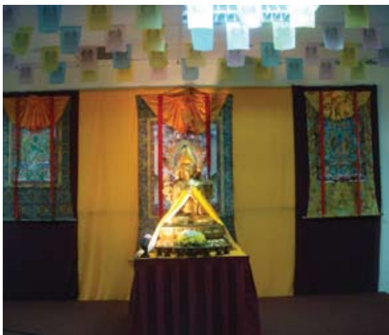
Kechara transformed the Caring Society of Penang into a celestial paradise! A beautiful stage featuring a three-foot Lama Tsongkhapa statue and stunning thangkas caught every shopper's eye.