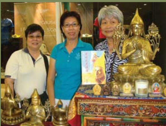
Happy shoppers stop by for blessings from our many beautiful Buddhas.