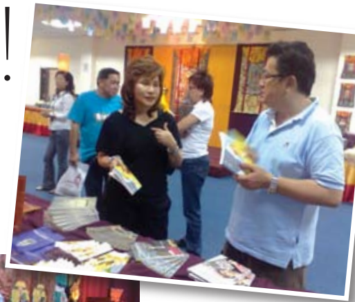
Road shows like these provide the opportunity for Malaysians around the country to meet Kechara, share Dharma and find out what we do.

Our four Kechara Dharma outlets in the Klang Valley have never been just shops. Instead, they are there to bring the huge benefit of Dharma to others, and to introduce Malaysians to the many works of Kechara's 12 departments. Now, they're venturing out of the Klang valley and into other prominent Malaysian cities.