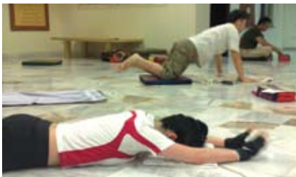
KMP's daily prostration retreat at Kechara's main gompas.

A large part of Dharma work and practice is about working harmoniously with our Dharma family. The success of individual practice is very closely tied to the community we work with. With this in mind, Kechara Media & Publications did a collective group retreat to collect 100,000 prostrations, in dedication of our Lama's work and growth of Dharma in Malaysia.