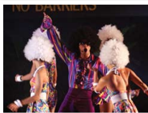
Up For A Good Time! As performers livened up the stage, Kechara people partied it up to raise funds for KSK's current work and future plans to have its own permanent building.