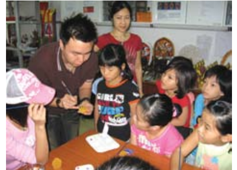
Clockwise from left MKC classes are interactive and encourage discussion between kids.

The MKC kids on a field trip to Kechara Saraswati Arts.