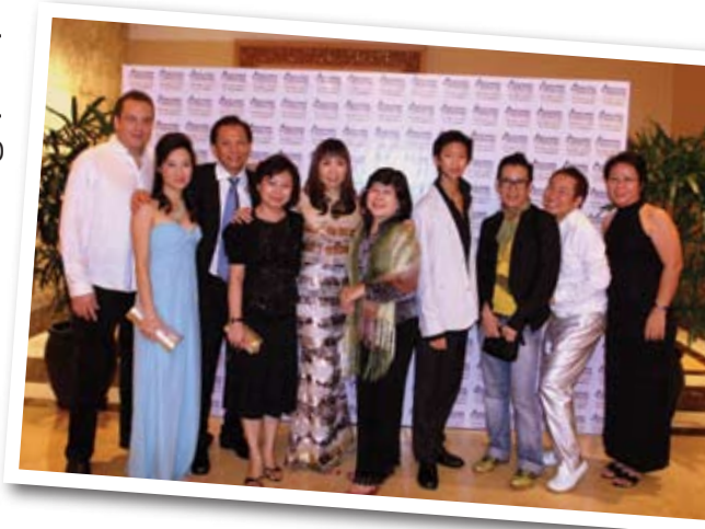
Shiny, Happy People: Friends from Kechara House got together for a smashing evening of fun and glamorous style, all for the good cause of raising awareness of Kechara Soup Kitchen

As the dinner was in support of KSK, the dinner saw a special twist. The first course served was a KSK food bag, packed exactly as it is for our weekly rounds. The MC explained to guests that this was what the homeless and urban poor received every week from us. Then, the rest of the dinner was served (don't worry, we didn't starve our guests!)